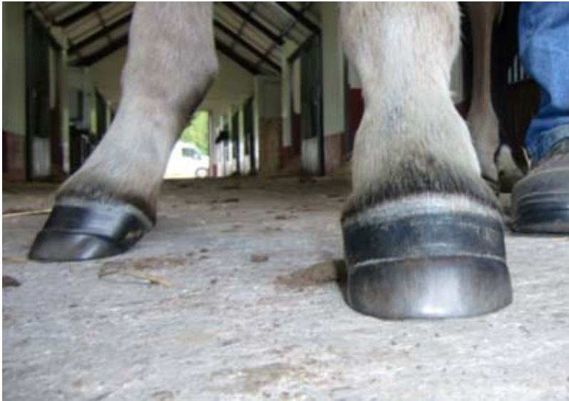
Figure 1: A foal of approximately two months age showing the foal hoof crease on both front hooves, marking the time of birth.

Smallwood JE, Albright SM, Metcalf MR, Thrall DE, Harrington BD. "A xeroradiographic study of the developing equine foredigit and metacarpophalangeal region from birth to six months of age." Veterinary Radiology 30, no. 3 (1989): 98-110.