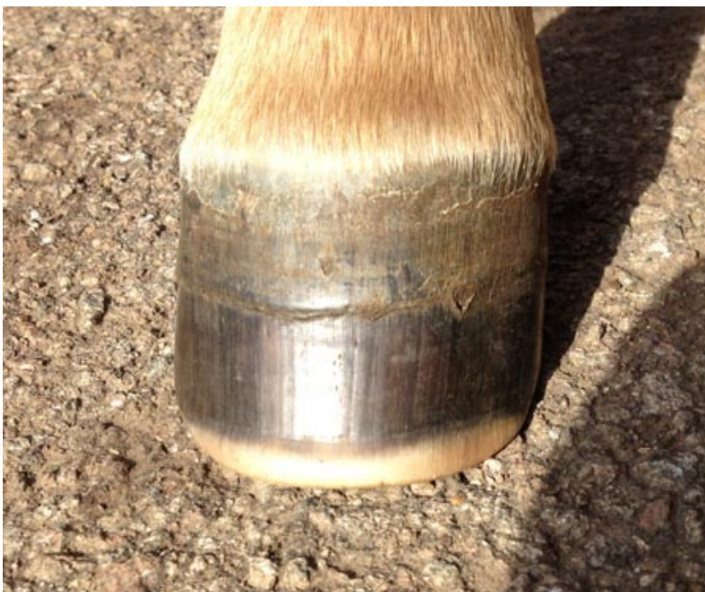
Figure 2: A foal of approximately 4 months of age with dark foal hoof proximal to the FHC and distal light coloured fetal hoof.