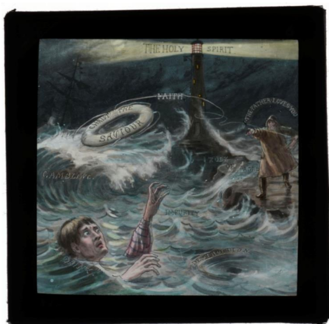
Figure 1 makes explicit the interventionist role which members of the total abstinence, or 'teetotal' movement were expected to fulfil with respect to alcohol. This magic lantern slide, part of a flexible Victorian technology which was widely

drink as so powerful and volatile that a single drink may put one on the road to the hospital, the poorhouse or the jail. Therefore, the argument goes, the only way to avoid risk is to avoid drink entirely. Risk avoidance, therefore, was at the heart of teetotalism and the agents for encouraging risk prevention were often children. Many temperance organisations were closely linked with Christian belief or set up under the auspices of religious groups, and moral responsibility was also appealed to, as well as enlightened self-interest. It is as well to remember that deeper resonances operated after formal links with religion had begun to decay; as Iain Wilkinson remarks, 'Within a secularized cosmology, risk adopts the traditional mantle of sin' (2001: 4). In the material which this paper considers, the risks which alcohol could present were frequently and uncompromisingly linked with sin, which individuals and society were shown as having a duty to oppose.