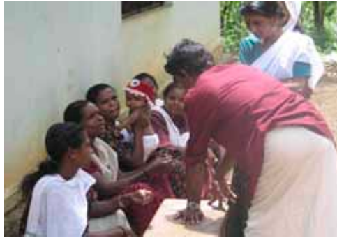
Kani women at the voting center, May 2008 17

How about the women? The Kani tribal head was a man; all the guides were men; all the officers of the Trust are men. In the context of the data about the Kani society presented earlier, it is not surprising that no woman would stand for election to the Executive Committee. The decision to appoint two women members was made by men on behalf of women.