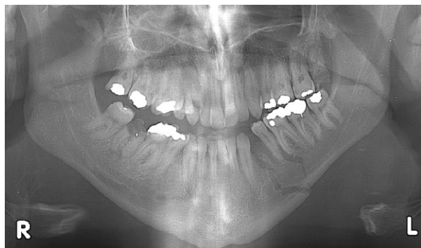
Figure 1 Orthopantomography showing fractured site.