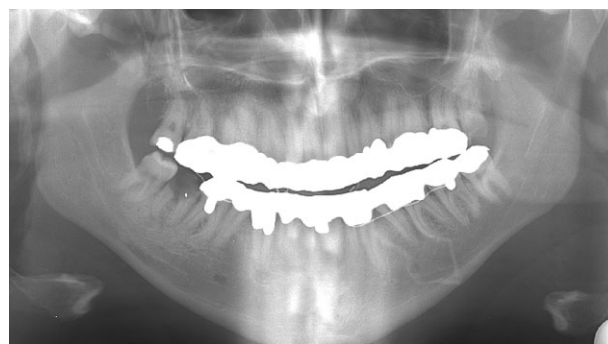
Figure 3 Orthopantomography: 6 weeks after Inter-maxillary Fixation (IMF).

The patient was taken to theatre, and local anaesthetic was administered. The fracture was reduced by manipulation of the mandible into its correct anatomical position. The metal cap splints were cemented with glass ionomer cement. The locking plate was easily applied and secured with two screws, thus rigidly immobilising the fracture. A 24-h period was allowed for secondary setting of the glass ionomer cement prior to applying elastic intermaxillary fixation.