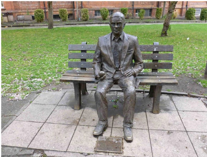
Figure 1. Alan Turing statue, Sackville Gardens.

the ways “you’re told to see certain things” and how he’s got his “own eyes”. His descriptions focus on notions of visibility and invisibility, what is seen and unseen by different people. The word “twisted” is both expressive and ambivalent in the above quote. He describes a certain self-respect which he takes from taking his own twisted view of society, and also describes how by developing his own personal day-to-day practice of looking, listening, attending and acting he has been able to find a way through, to manage the city’s most urgent risks and to gain a certain kudos from his peers by doing so.