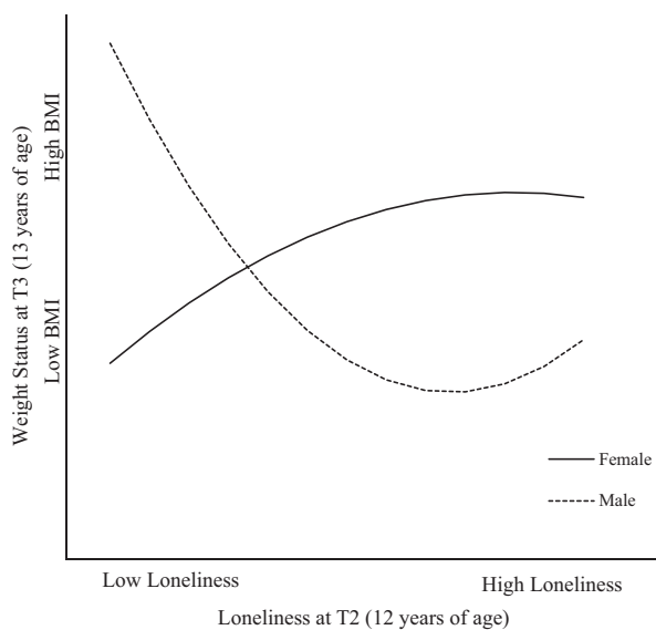
Fig. 2 Slopes of the relation between loneliness T2 (age 12 years) and BMI T3 (age 13 years) as a function of gender

years for boys. This result suggests that loneliness may have a particular role in increasing weight for girls and reducing weight for boys. There were no other significant linear or quadratic effects of loneliness on z-BMI over time (See Tables S4–6 for details).