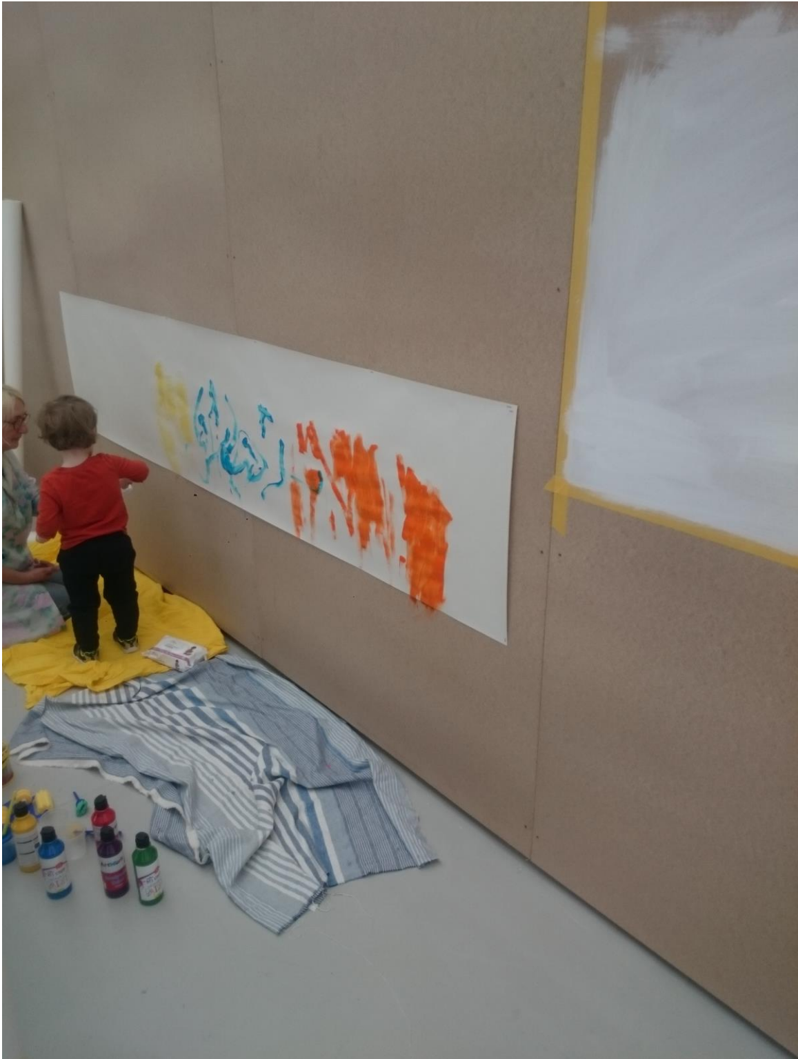
Fig. 4. 'Messy Democracy', installation view.