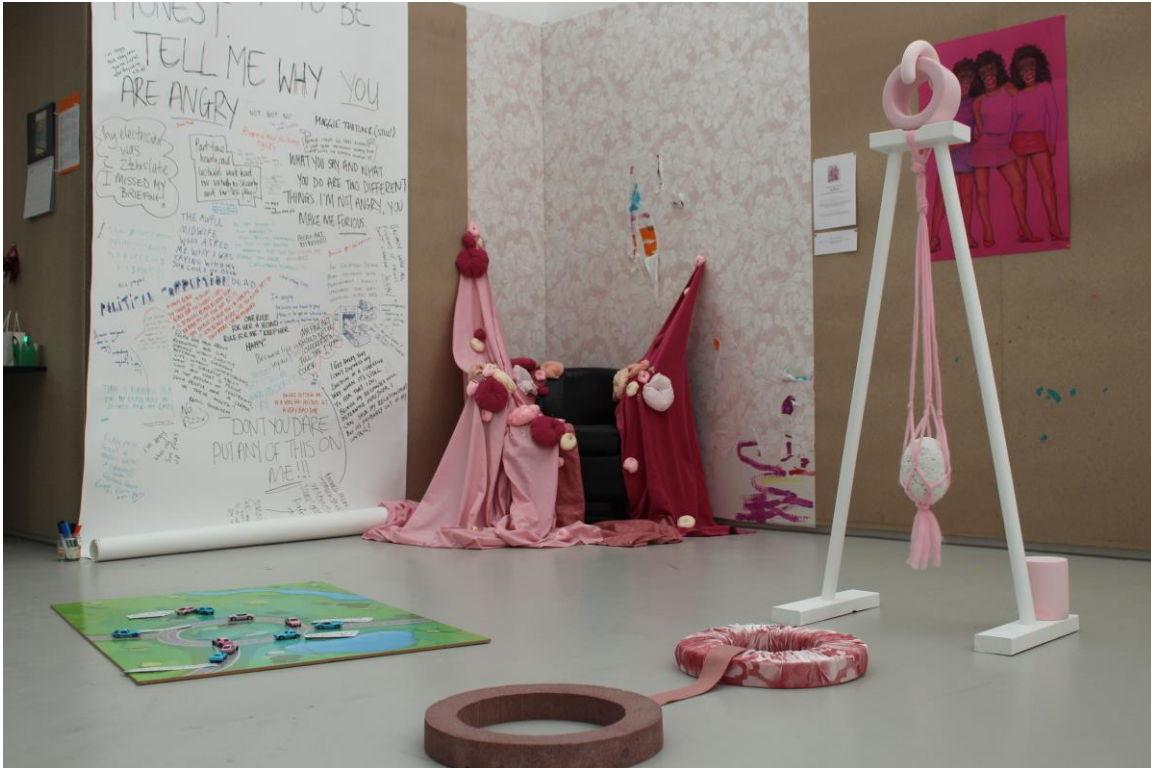
Fig. 1. ‘CUNTHOUSE’. ‘Messy Democracy’, installation view.

‘One can teach what one doesn’t know if the student is emancipated [...] To emancipate an ignorant person, one must be, and one need only be, emancipated oneself’ (Rancière 1991: 15).