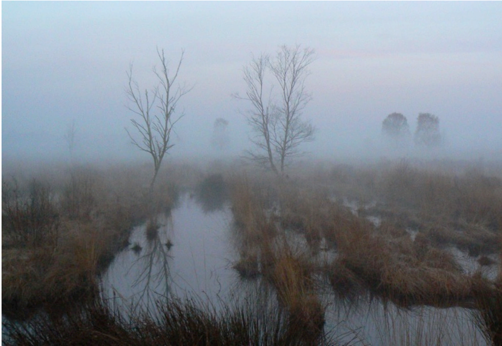
Cadishead Moss – 2015