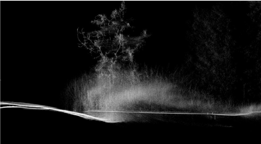
Standing Ash - Intaglio-type Etching 2017

The process of taking the scan data out of the computer and recreating an etching or drawing is key to the works. Captured digital data combines with traditional printing and drawing, resulting in a re-imagined vision linking digital and aesthetic. More widely, I am considering whether we should unconditionally accept and trust digital information presented to us. My images begin as data files, moments in time collected from real locations, the resulting artworks however, are my memory of sensory experiences and personal knowledge as experienced during walking. They are a form of waymarker and not designed to map locations or guide audiences to specific destinations; instead, the viewer is required to bring their own memories to enable a personal journey and complete the story. Matrix of