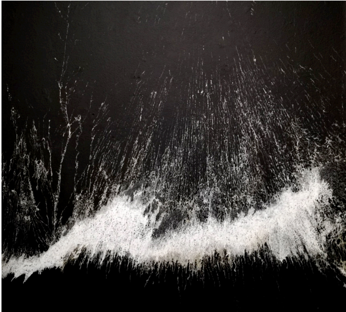
Haecceity – Site Specific wall drawings (detail) - 2018 Warrington Museum and Art Gallery.

interface', 6 the point at which surface and weather combines to immerse us through multiple senses, informing knowledge and instilling memory.