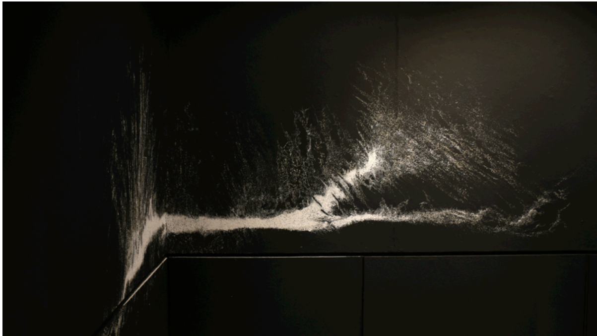
Haecceity – Site Specific wall drawings 2018 Warrington Museum and Art Gallery.

I also created 4 interactive screenprints. The images were printed through silkscreens in a traditional manner, but instead of using normal inks I used conductive ink. This commercially available ink contains fragments of conductive material, which, when dried, allow the conductivity of electricity. The images printed with this ink respond to human touch by conducting the electricity from the hand. When touched, the images triggered sounds recorded while walking on location, transforming the visual into a sonic experience. The recorded sounds were activated through direct contact with the artworks; were necessary in order to gain the experience as captured sounds were played from various points around the gallery – not necessarily from a point closest to the trigger – requiring participation and movement in order to fully engage with the pieces. 7 In this way, the viewer's normal line of vision and behaviour in the gallery was challenged, through a combination of senses, experience and memory.