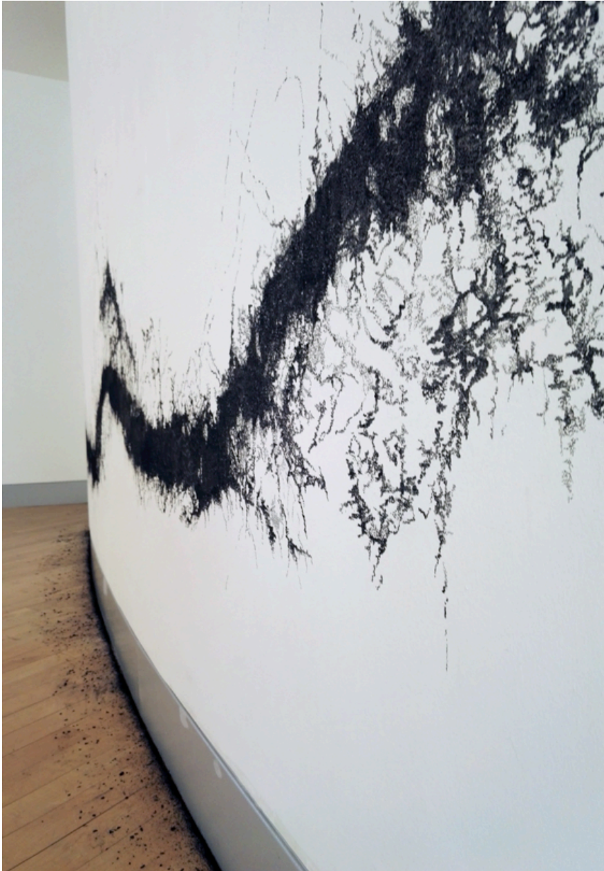
Matrix of Movement – Site specific charcoal wall drawing, The Brindley 2015

Intaglio etching plates are created using acrylic based processes and photopolymer films. These photo-reactive films have been an important development in the printmaking world in the last twenty years. Developed for the circuit board industry, they carry the ability to record and transfer huge amounts of data. For artists the development of these films have enabled the photographic transfer of images onto metal plates without the need for chemical etching, creating surfaces akin to traditional intaglio etchings. The prints are large scale, with single plates often nearly a meter long and extremely labour intensive to print. They are rich in ink and require a constant balancing between depth of saturation of ink on paper with a sense of movement and light.