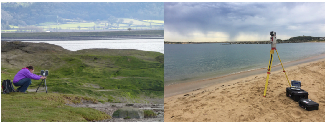
The River Mersey, UK and The Hunter River, NSW - 2016

Matrix of Movement (2016-18) investigated shifts in cultural approaches to wayfaring and navigation, with a specific focus on The River Mersey in the North West of England and The Hunter River in New South Wales, Australia. The two rivers are connected through human exploration and exploitation. They are linked through historical trade connections in the 19 th century, which led to human and material exports that fuelled the industrial revolution on both continents. The cities of Liverpool, UK and Newcastle, Australia are inextricably linked with the rivers and wetlands running through them. For their communities, the rivers and wetlands hold stories and memories of a life in tune with seasonal patterns of wet and dry, inviting tales of imagination, mystery refuge and escape. For example, the discovery of preserved individuals in the mossland landscape, such as the Iron Age 'Druid Prince' who appeared to have been drugged and then ritually sacrificed, have nurtured a 'spiritual dread'. 2