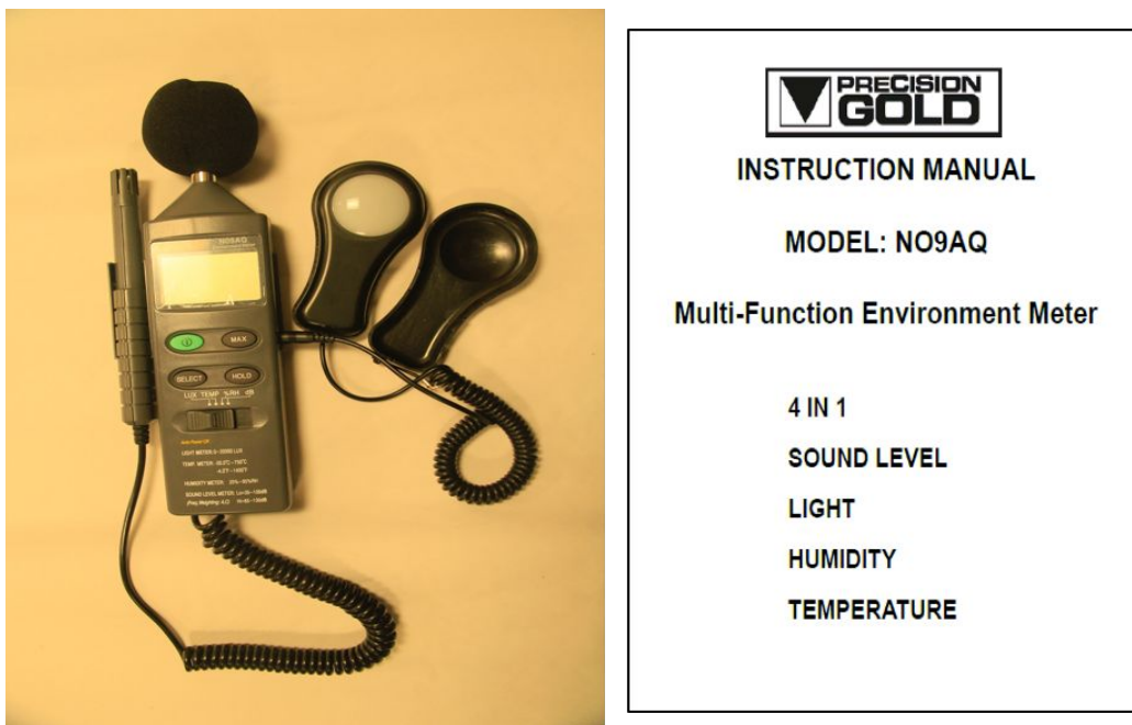
Figure 1: Photograph of Environment Meter