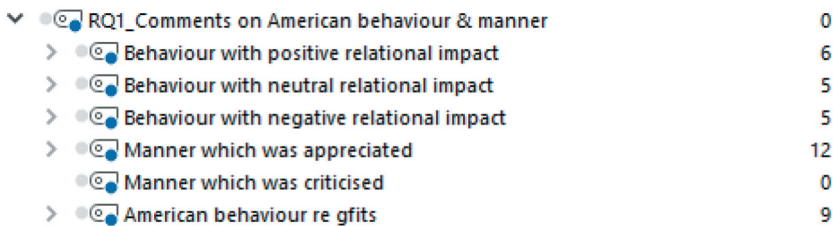
Figure 1. Screenshot of codings on Chinese delegates' perceptions of American participants' behaviour and manner (collapsed view).

In this positive evaluation of their discussion, the HoD attributed it at least partly to the connections they could draw between their respective work contexts and experiences. This was reiterated by the Deputy HoD (DHoD) two days later, who commented on their