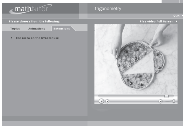
mathtutor Pythagoras illustrated with 'The pizza on the hypotenuse'