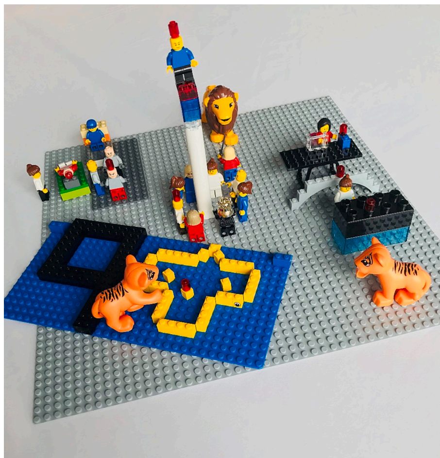
Fig. 0. Example of LSP build.

The central focus of the scoping review was to establish how LEGO® SERIOUS PLAY® (LSP) is being used to support the development of students within an educational context. The choice to focus broadly on its use within education, rather than specifically on nursing education, was taken following an initial review of the nursing literature which revealed only a single result. Whilst widening the search to healthcare education, in general, did supply a few more results, it was felt a wider focus would enable better exploration of the key themes. To expand on this and explore this in more depth two further questions were developed. The second question sought to explore the advantages of using LSP as an educational tool with a view to understanding what its use had achieved. The third and final question set out to explore if there were any factors either within the LSP methodology and/or educational