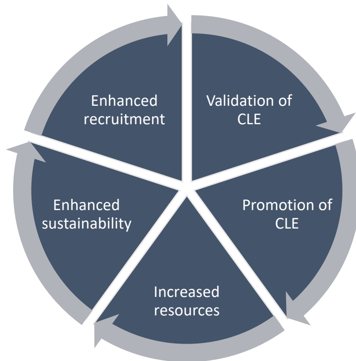
Figure 1: The cycle of opportunity presented by QWE

The opportunities presented by the advent of QWE have the potential to greatly augment clinic development and innovation. Figure 1 demonstrates five interlinked and cyclical factors linked to QWE that could serve to enhance clinical legal education within Higher Education institutions.