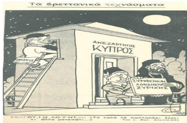
Figure 2: To Vima , 11 December 1960

Finally, it is worth noting that the general elections took place on 13 December 1959, while the negotiations that followed the Zurich-London Agreements continued until July 1960. During this 7-month period, important decisions about the future and administration of the SBA were taken. These focused on debates concerning the size of the Areas, 121 whether Appendix O would be legally binding, 122 and what would happen to the Areas if they were no longer needed by the UK. 123 So heated were the negotiations that in January 1960, the Undersecretary of State for the Colonies had to convene another conference in London between British, Greek, Turkish and Cypriot delegates in order to resolve their disagreements. 124 As late as April 1960, four months after the elections and 14 months after the signing of the Treaty of Establishment, the Undersecretary of State for the Colonies was instructed by Cabinet to ‘have an informal meeting with Archbishop Makarios with a view to making it clear that, unless he accepted Dr Kutchuk’s proposal [on the size of the SBA], we would break the discussions and seek some other settlement of the Cyprus problem in consultation with the Greek and Turkish