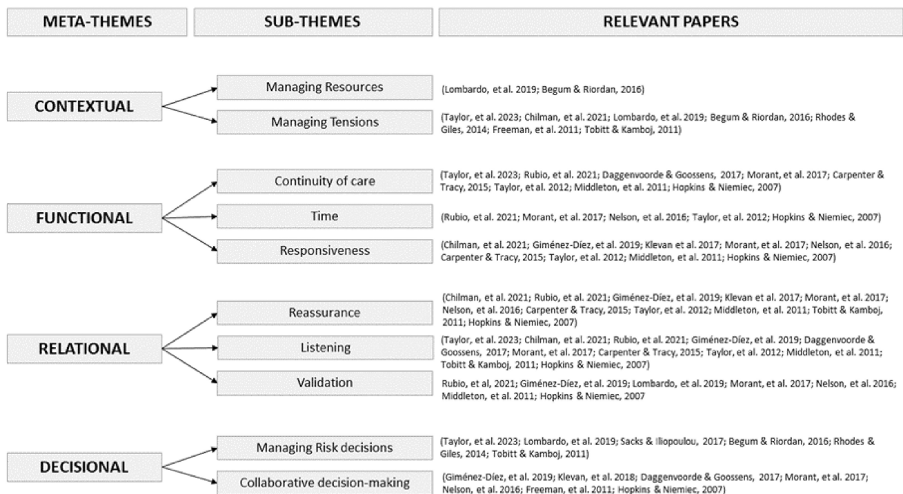
FIGURE 2 Reciprocal translation (list of meta-themes and related sub-themes).