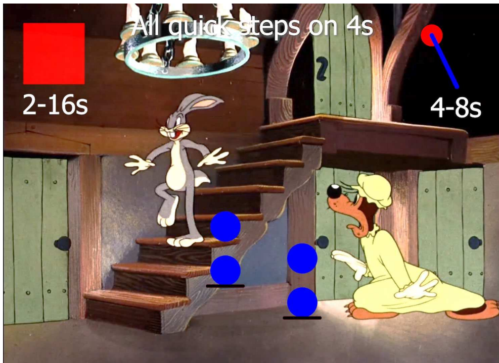
Figure 4: Timing analysis with originated click-track metronomes (© Mark Mason, 2023) Still from 'Little Red Riding Rabbit' Dir: Friz Freleng (© Warner Brothers Inc., 1944)

Test the Method. To generate new insights in the process and validity of the method. Data required: Secondary source animated films and extant detail/bar sheets gathered in Part 1. Data collection: Sequences will be time corrected to 24 frames per second. Vision and sound will be analysed frame by frame to identify beat, tempo and rhythmic patterns. This data collection will generate a visual data set of the rhythmic structure of the sequences. Bar sheets will be created to further understand the timing structure of the animation (figures 4 and 5).