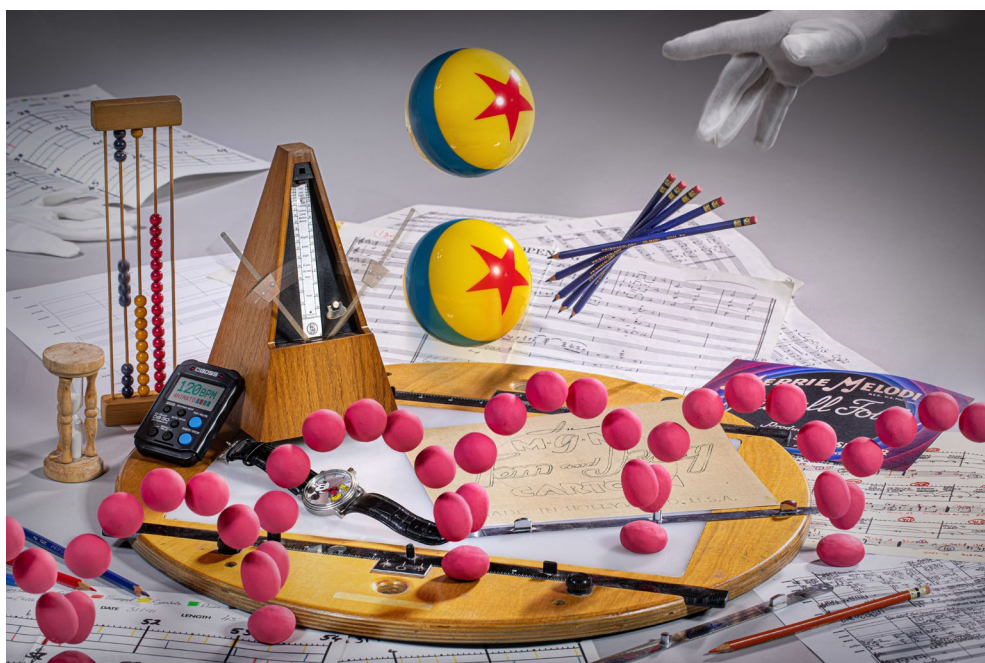
Figure 1: Unstill Life (© Mark Mason, 2023)

Keywords: animation; timing; cartoons; synchronisation; beats; tempo; rhythm; music.