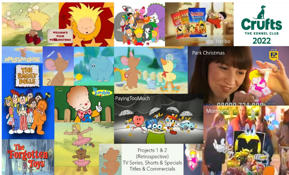
Figure 2: Examples of work from Projects 1 and 2 (© Mark Mason, 2023)