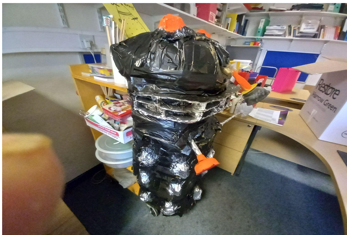
Figure 2. Our Dalek of Resources.

During the pandemic we determined to find ways to make our online classrooms as active, creative and embodied as our face-to-face (F2F) classrooms had been. Where previously we had facilitated collage and making and drawing and writing to learn - with our 'Dalek of Resources' (Abegglen et al., 2020) wheeled into our bespoke classroom space to facilitate active learning in practice - now we had to break down all that we needed those resources for - and decide what we could ask participants to do instead in their own homes.