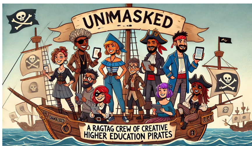
Figure 6. An AI-generated image of this vignette by Emma Gillaspy. Emma Gillaspy CC BY 4.0 DEED.

Seeing academics and universities flee unethical social media platforms has been a heartening experience. There is good in our digital spaces and it's critical we use these to be our true selves rather than trying to assimilate to any current or future system norms. Our tale is one of positive disruption, working at the edges to nudge the direction of the fleet of HE merchant ships. The ability to find commonality, to celebrate uniqueness, are the skills needed for HE to survive in our postdigital future. All are welcome on board this creative ship Unmasked (Figure 6). The only orders are that you drink up that learning me hearties! Now bring me that horizon, yo ho ho!