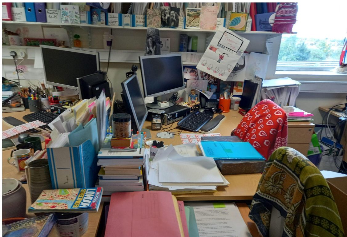
Figure 3. Fragment of the former office space.

And that playful, colourful office - where did the treasure go? We rescued what we could - now safely stored away in a 'cupboard of curiosities' in our caravan by the sea: