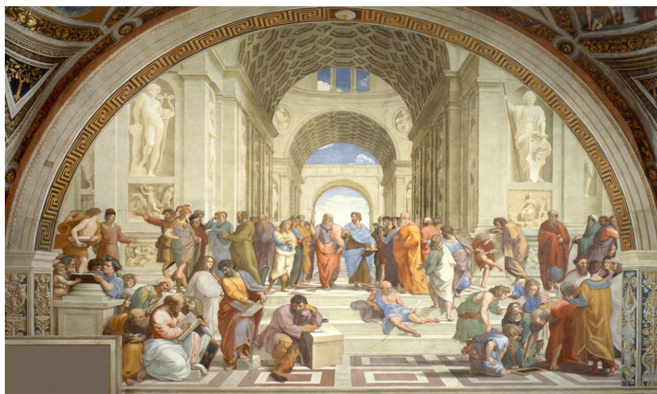
Figure 5. Raphael School of Athens.