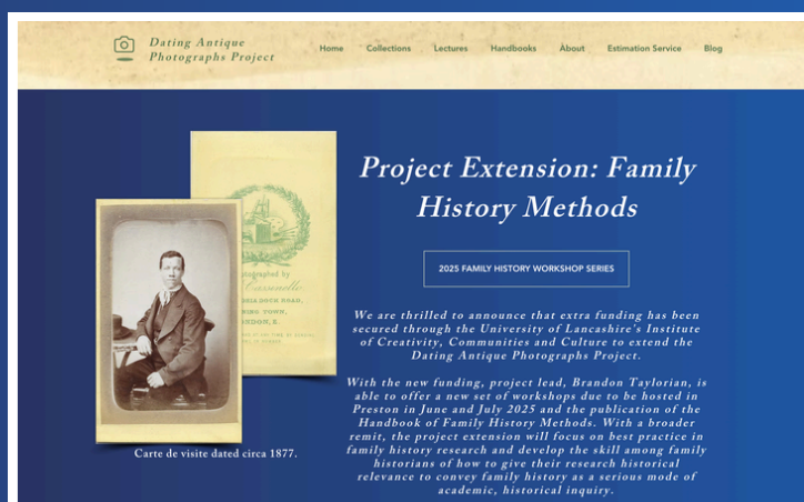
Updated main page of antiquephotographs.co.uk

Building on the previous project, the website www.antiquephotographs.co.uk was expanded to include resources from the 'Making Family History Matter' project extension, including the workshop presentation slides and a digital copy of the new handbook.