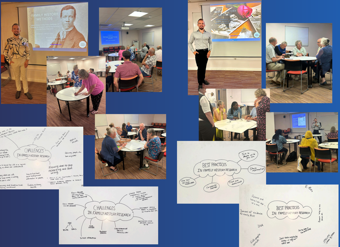
Pictures from 10th July 2025 workshop titled Family History Methods: Historical Relevance, Collecting Records, Heirlooms, Places of Interment and Secondary Sources attended by 28 people